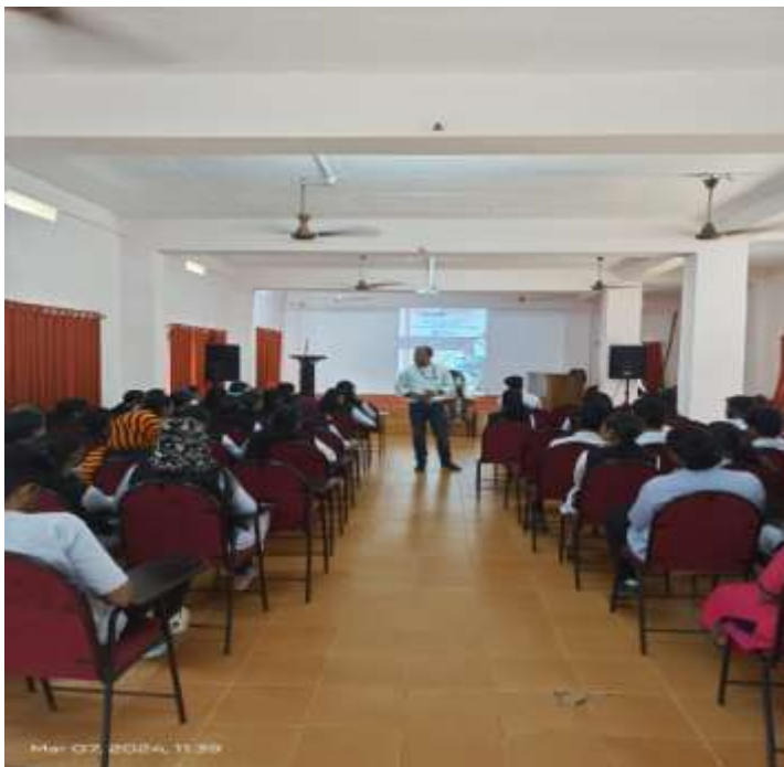
Students attending the seminar