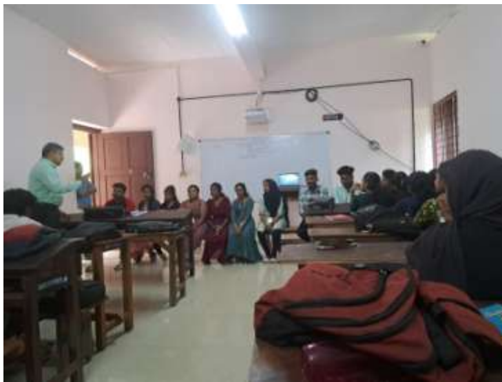
Selecting Students for the Competition